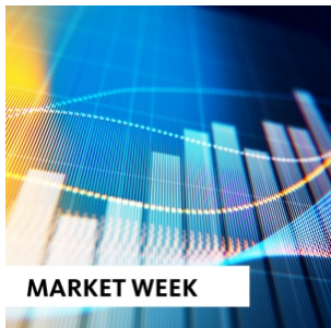
Chart reflects price changes, not total return. Because it does not include dividends or splits, it should not be used to benchmark performance of specific investments.